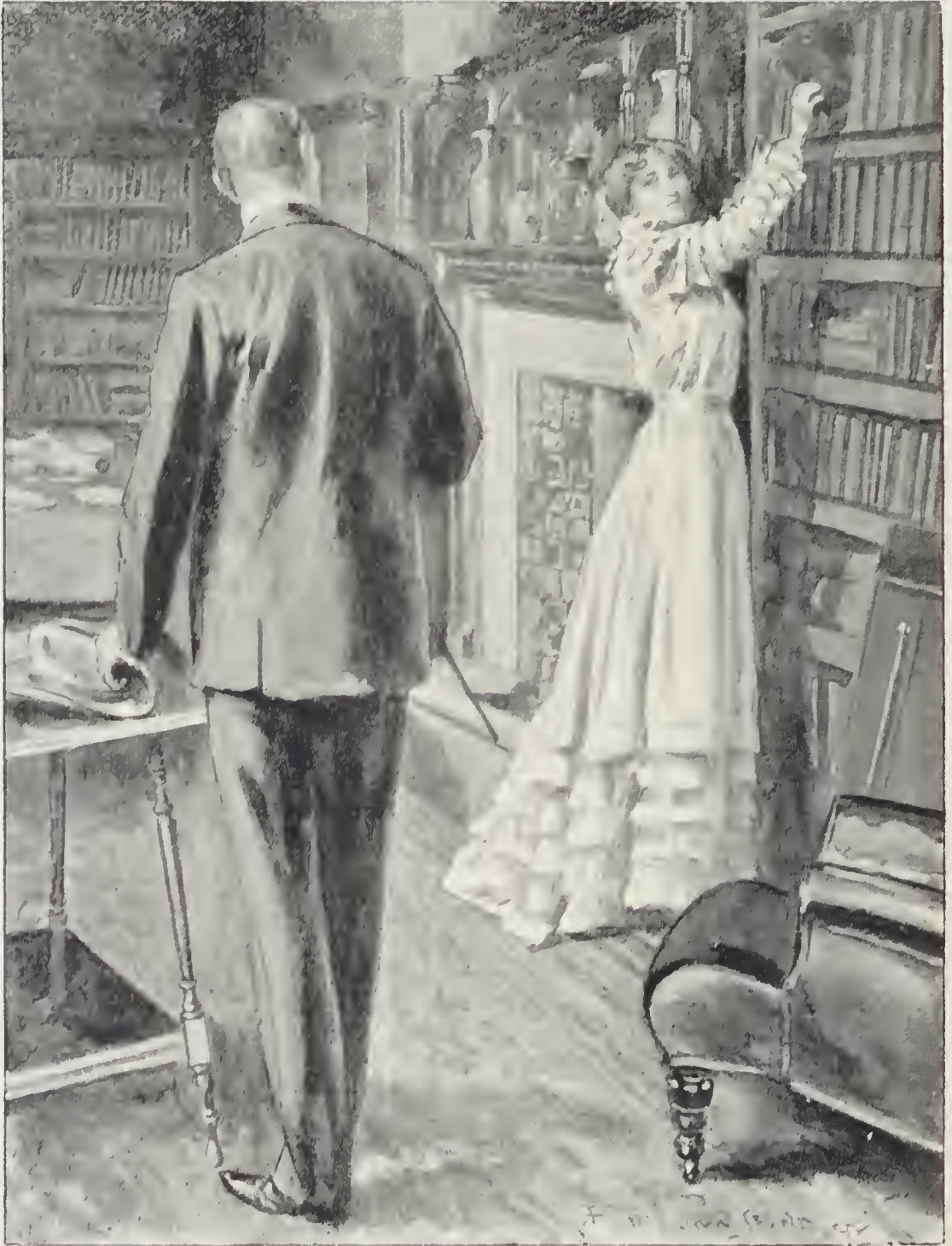
HE FOUND HIS SISTER IN THE ACT OF REPLACING A VOLUME UPON ITS PROFESSIONAL SHELF